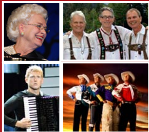
Color Flyer Insert with Registration Form